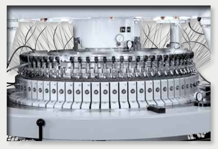
machine head of D4-2.2 X