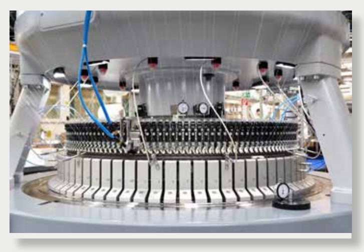
machine head of D4-2.2 X HPI Version

The D4 2.2 X also offers elastomeric plating.